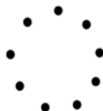
Circle of Chairs